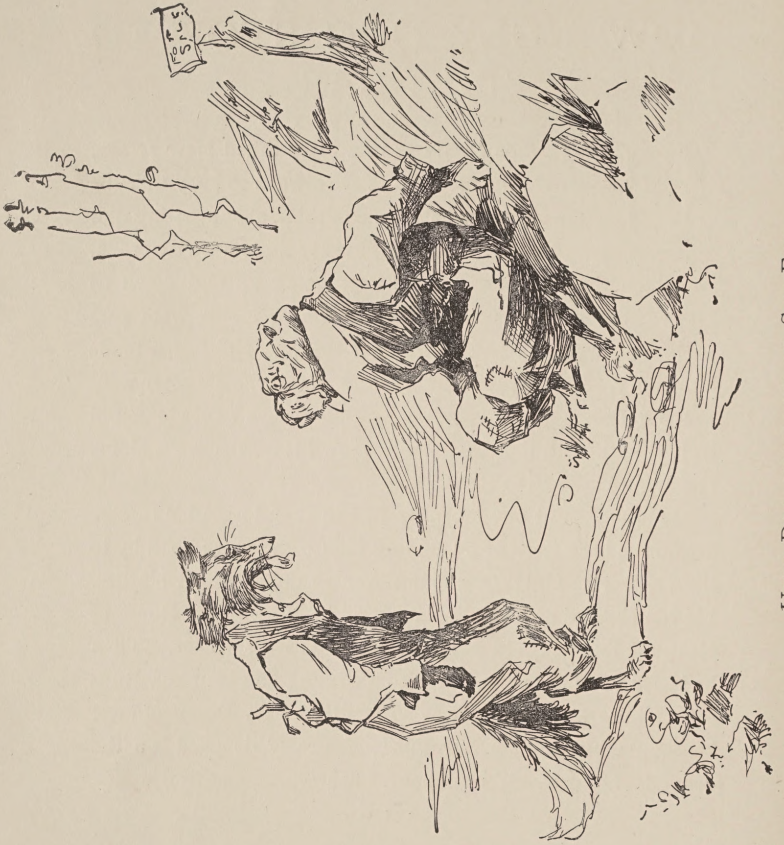
UGLY DOG COMPLAINS TO SLY FOX.